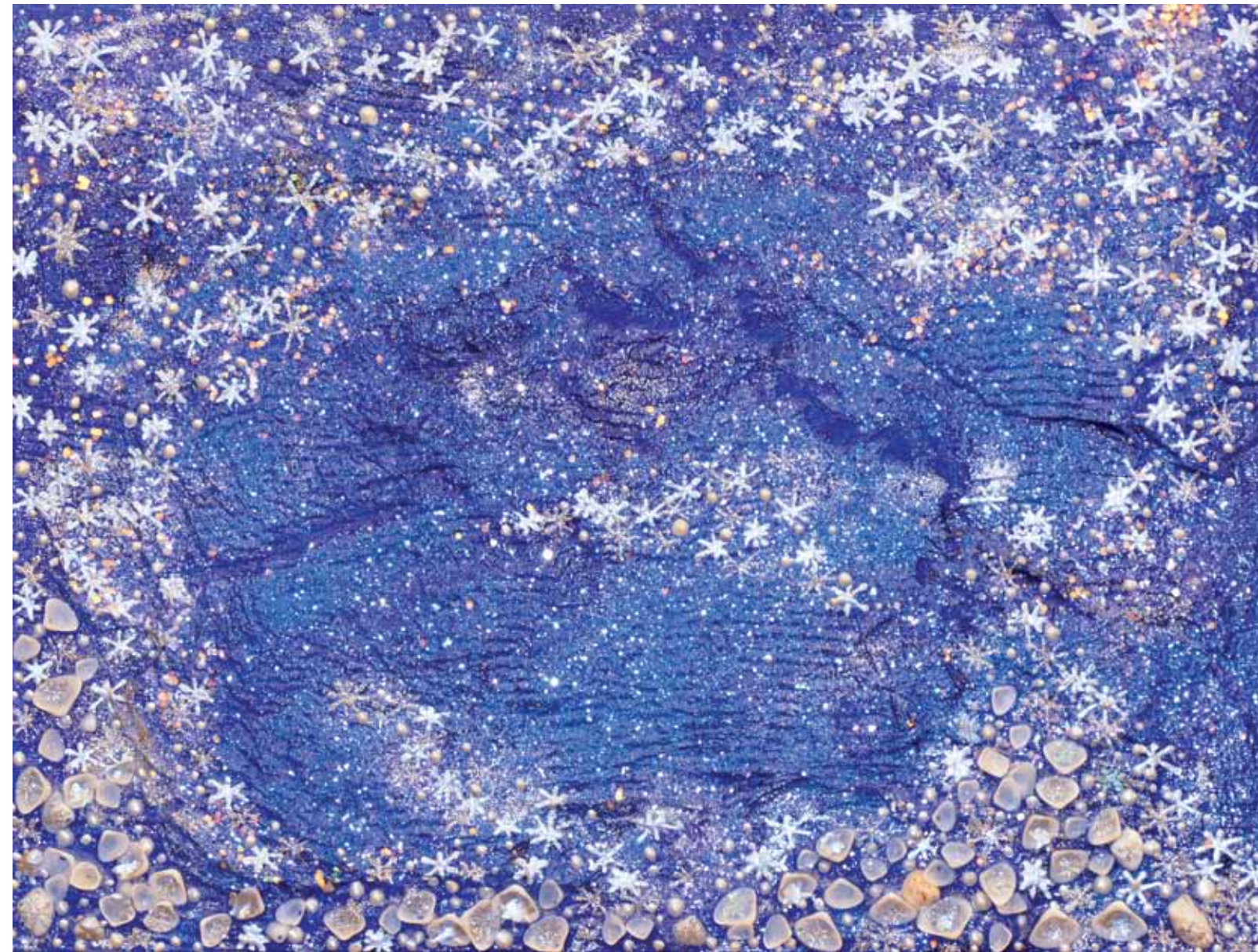
Intimate Reflections 4

Dmnc trova giovamento, non soltanto nella forma, ma anche nella sostanza, andando alla ricerca degli effetti più che delle cause, guardando all'essere e pensando al divenire. L'immagine dei cristalli d'acqua, rappresenta per l'artista, al tempo stesso, la perfezione e la superiorità della natura. Secondo lei non esiste al mondo cosa più pura dell'acqua che assume le forme più incredibili e spettacolari, quando si trasforma nei